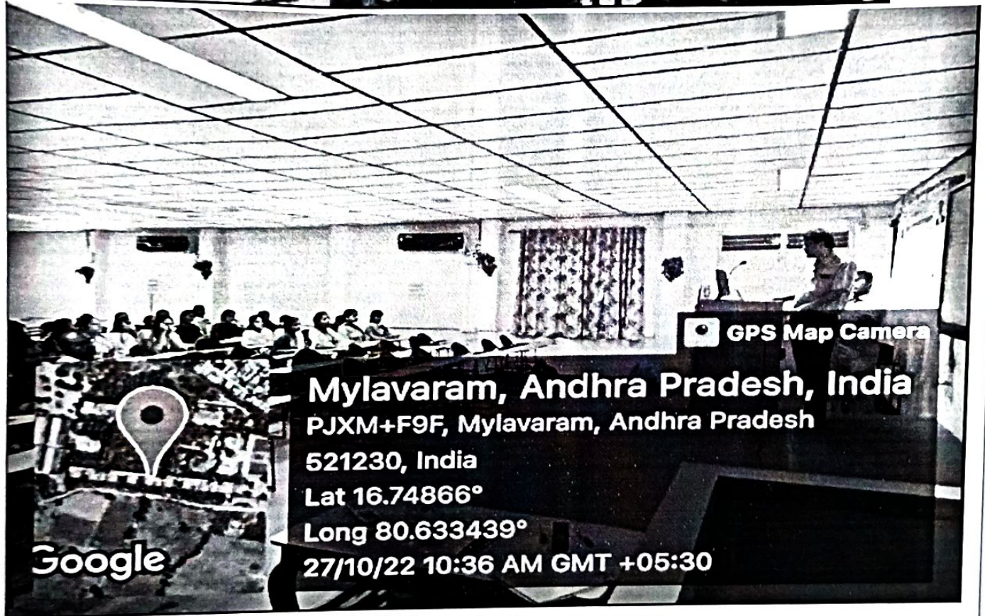
Lecture Delivering by Resource persons